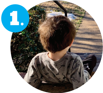
1. Sit and look at your surroundings.

Some things are better when you do them with others, like playing music, sports, and even storytelling! When you write a story with someone, it is called “co-writing,” which is similar to playing tag with your ideas and words. Before you start this activity, check out Where the Wild Things Are or another book about an adventure. Then ask a friend to join you to write a fictional adventure of your own. Be sure to listen to each other’s ideas and words as you organize the events in your story during this activity.