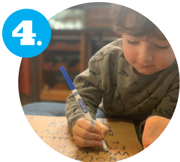
4. Write your own story.