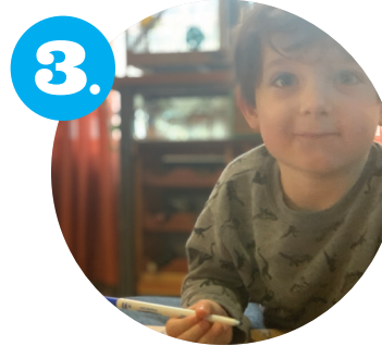
3. Discuss the order of what happens: first, second, and last.