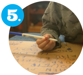
5. Share your final story with others.