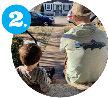
2. Think, talk, and listen about what you each observed or imagined.